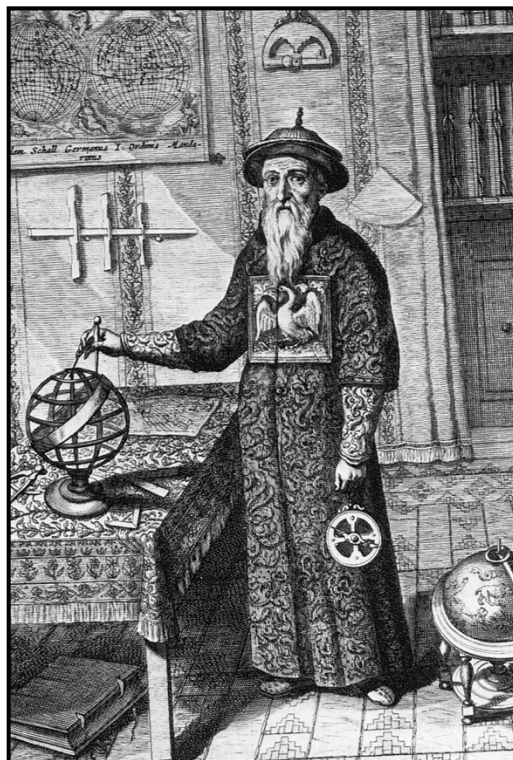
Jesuit Adam Schall (1591-1666), official astronomer at the Chinese Court

J. R. McNeill and William H. McNeill, The Human Web: A Bird's Eye View of World History , New York, 2003, pp. 309–18.