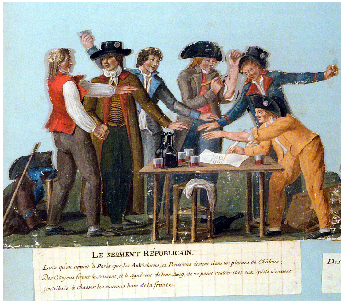
The Republican oath, signed in blood (c. 1792-94, J.-B. Lesueur)